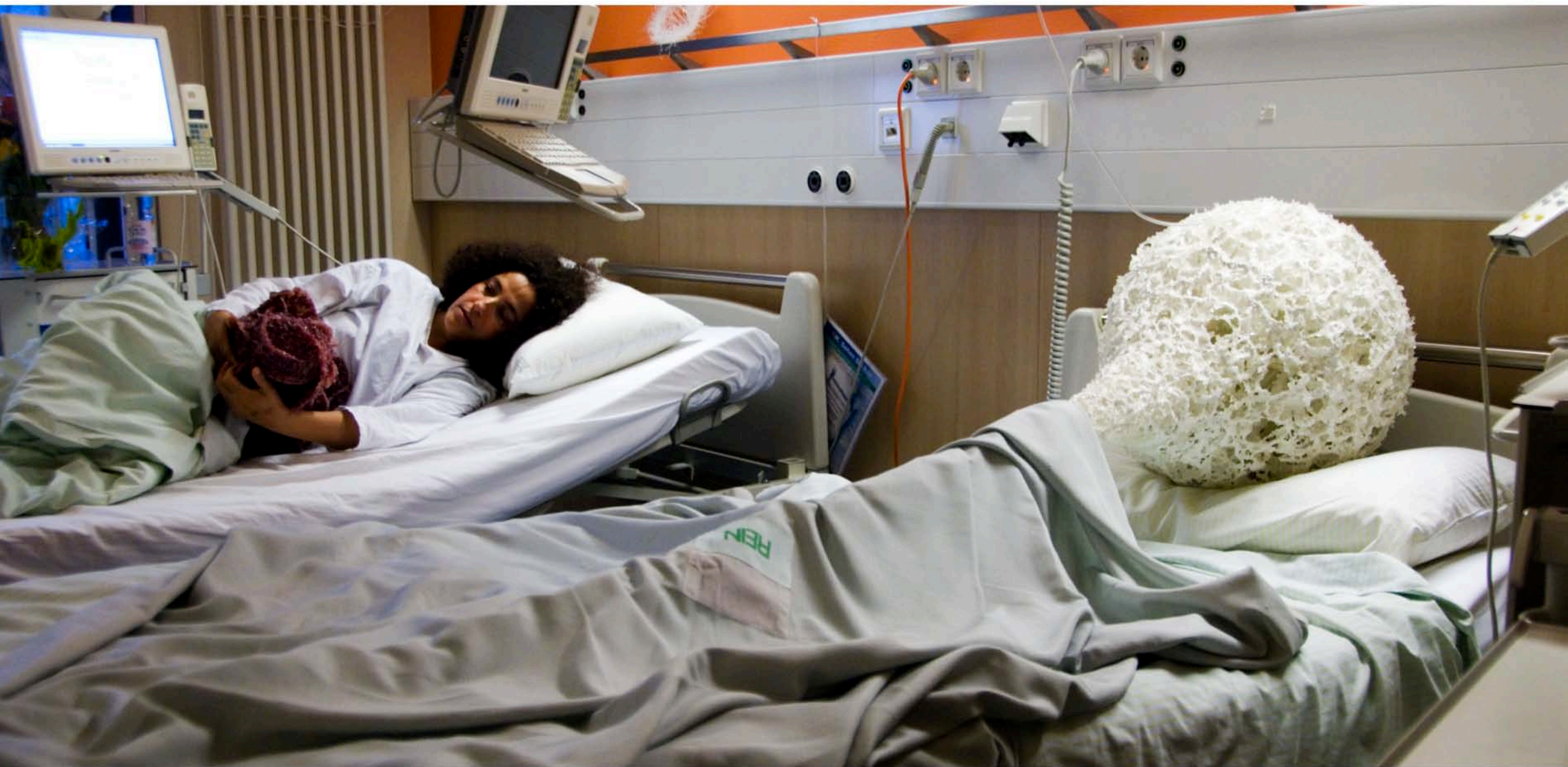
25.03.2010: university hospital, Düsseldorf. bioism creatures are self-infected. but nevertheless still greeted by humans