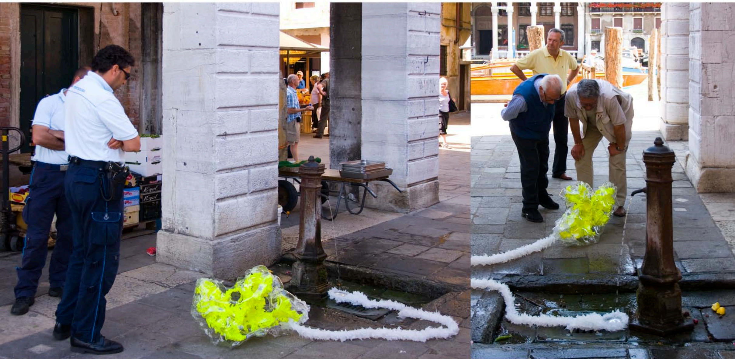
31.05-05.06.2011: Venice thirsty bioism creature at the fountain of Rialto-market, rising up its water content, maintaining plasma volume, keeping thermal regulation upright, dissolving, metabolizing