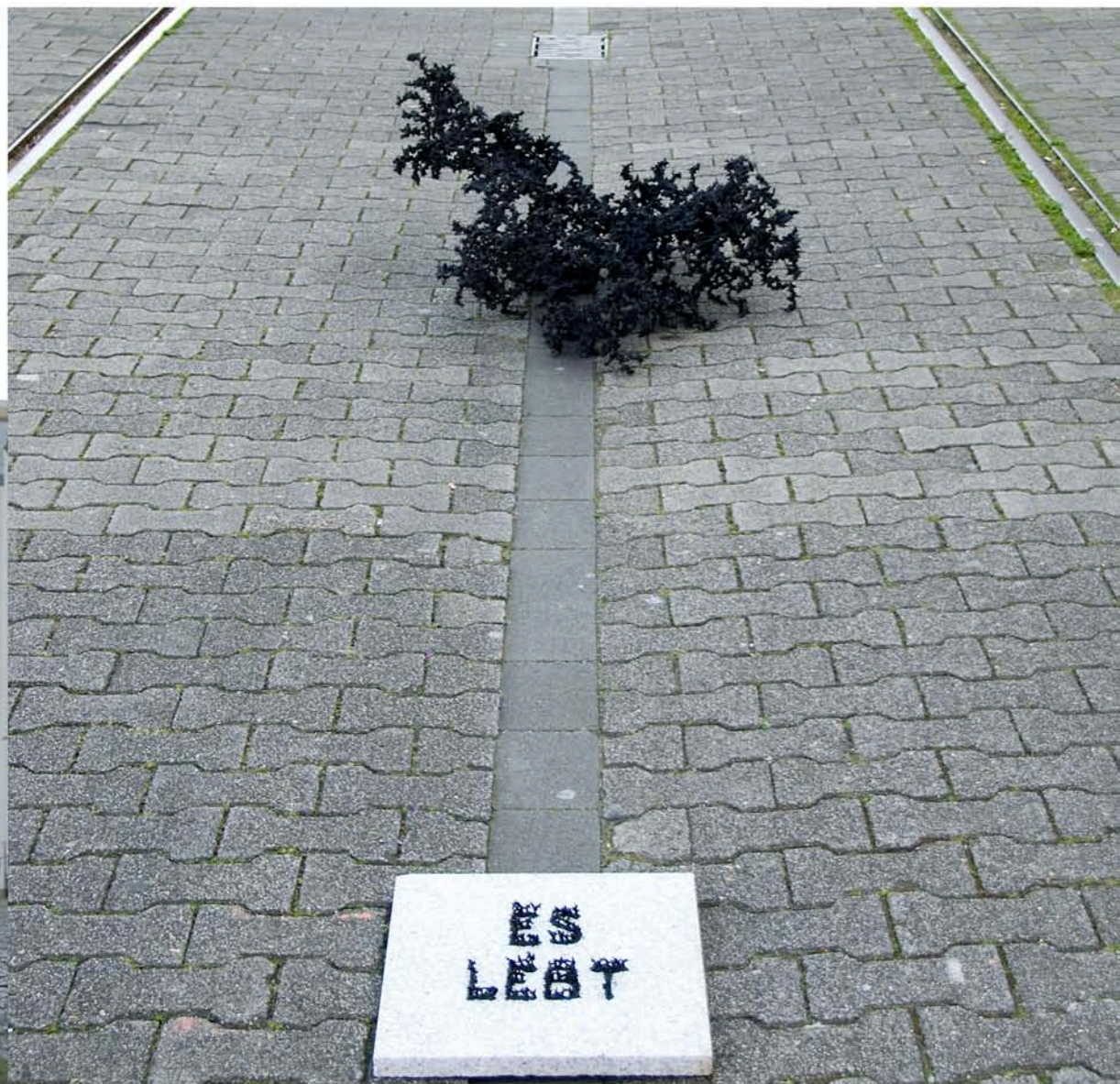
25.04.2009: Düsseldorf object #100 will move itself each day some distance and explore the city