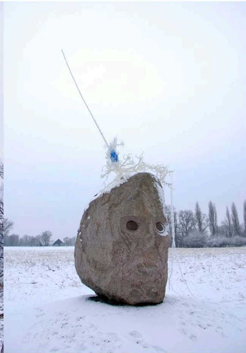
03.01.2010: Düsseldorf / Meerbusch bioism creature meets head of Joseph Beuys: "extend the definition of the art!"