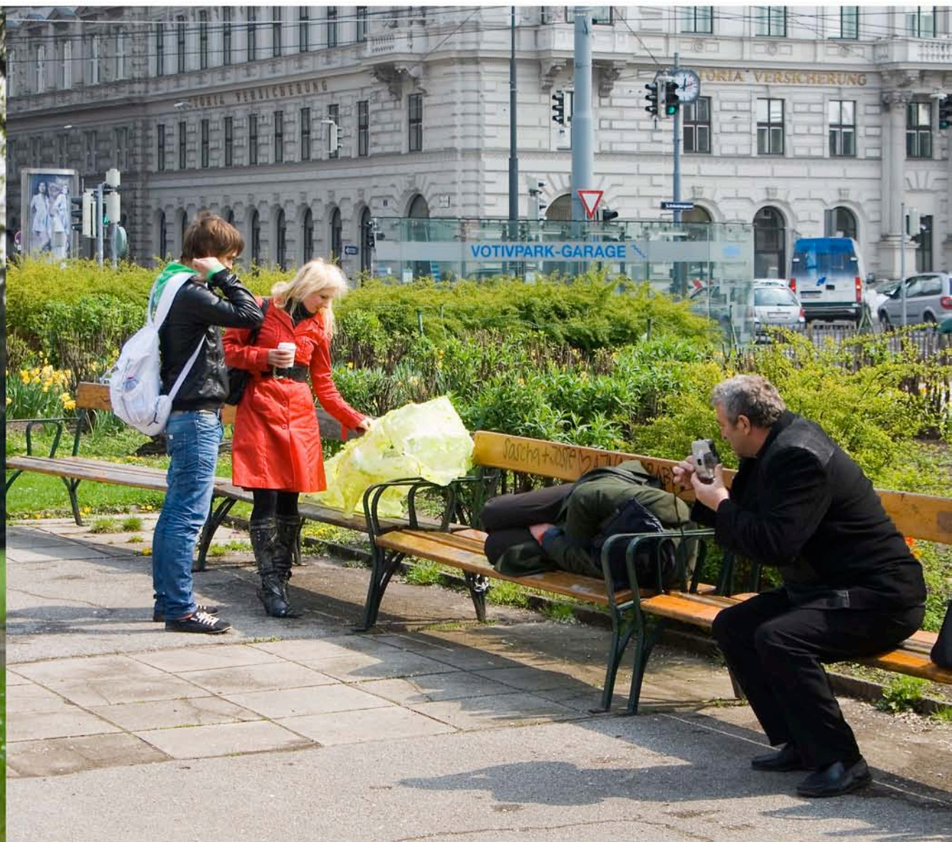
16.04.2010: Vienna bioism creature meets the silent voice of the intellect during the observations of perpetual movements of nucleoli in the nerve cells