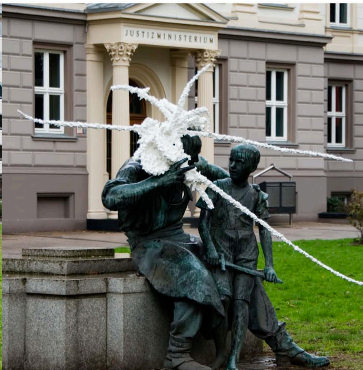
04.04.2010: Düsseldorf bioism creature meets blacksmith with his pupil: from homo faber to homo creator!