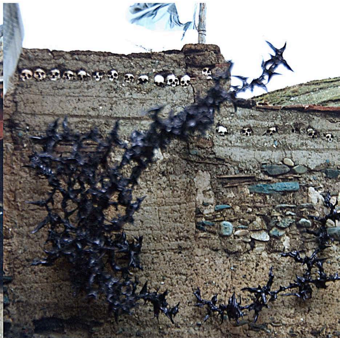
12.01.2010: after Sky Burial, Tibet bioism creatures meeting skulls of the monks; meditating about the termination of biological functions