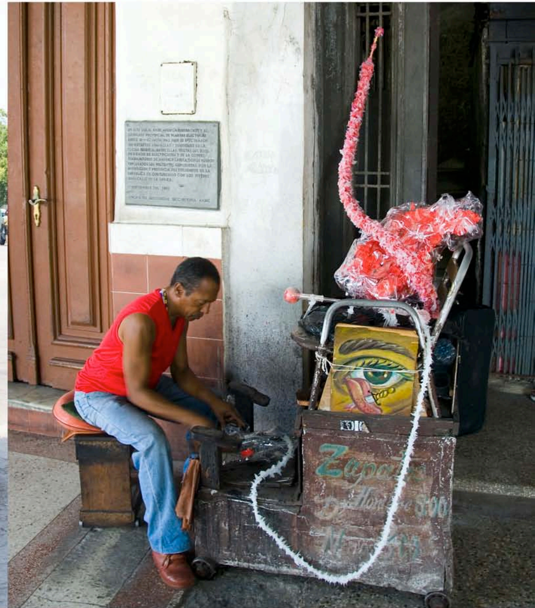
07.08-22.08.2011: Havana visiting museum, creeping through a little bit dusty deconstructivism lantern, and finally cleansed by friendly self-employer