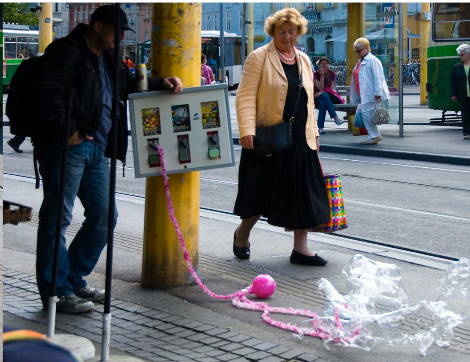
13.05.2011: Graz bioism creature meets the candy machine of Jakominiplatz, exploring desire for sweetness, hardwired into humans; obviously sweets triggering production of the brain's natural opioids