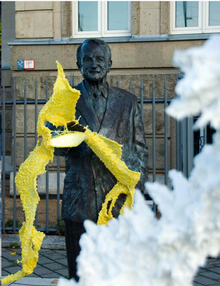
08.11. 2009: Düsseldorf bioism creatures exploring big world and meeting politician: "Kunst ist für alle da!"