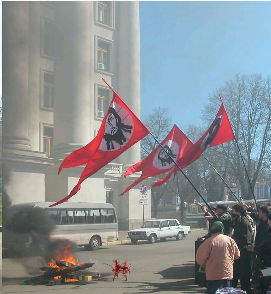
14.04.2004: Kiew bioism creatures flying around the smoke-generating device; smelling the dark, carbonized and oldest form of visual communication